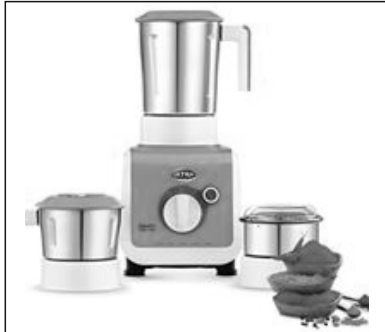
Ultra Stealth Mixer grinder