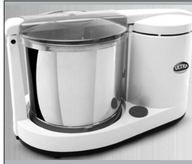
Ultra Dura+ wetgrinder

*We have supported TNF Georgia Chapter's Eye Camp project since its inception and several of the TNF National Conventions Visit us at innoconcepts.com